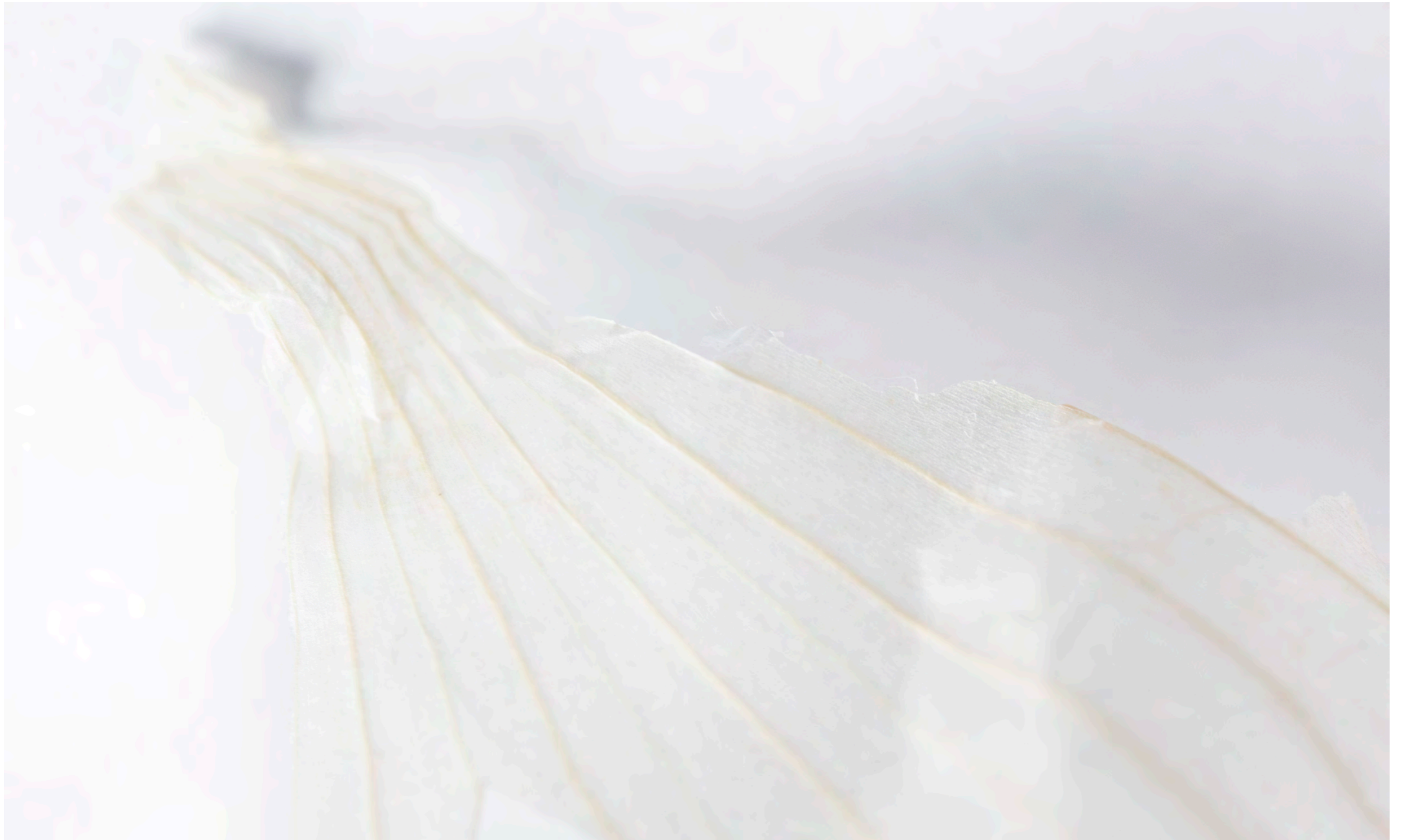
Translucent Garlic Skin Skin, 2019 Photography Variable Sizes

Delicate pink garlic skin lit from above and below to illustrate the delicate nature of the outer layer of the garlic skin