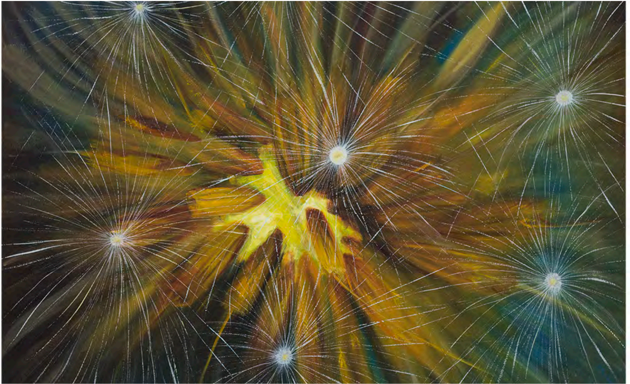
Burst Resilience, 2017 Painting in Oil 81X101i cm