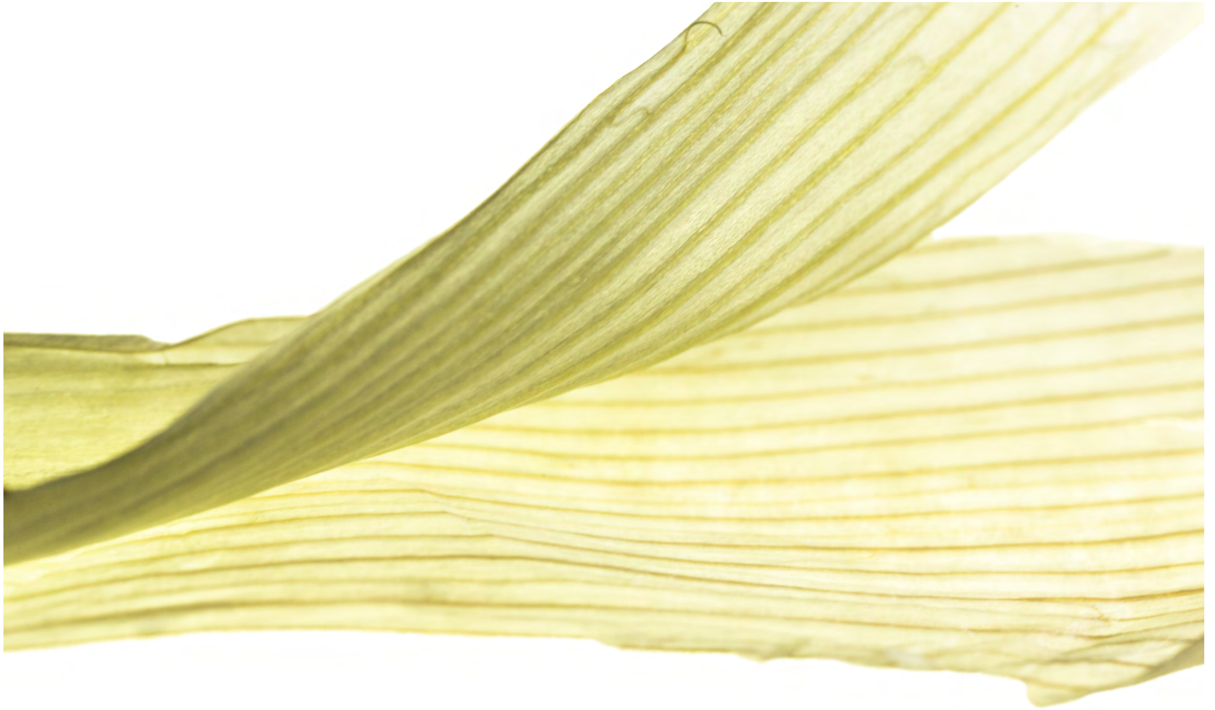
Lines L'uscita , 2019 Photography Variable Sizes