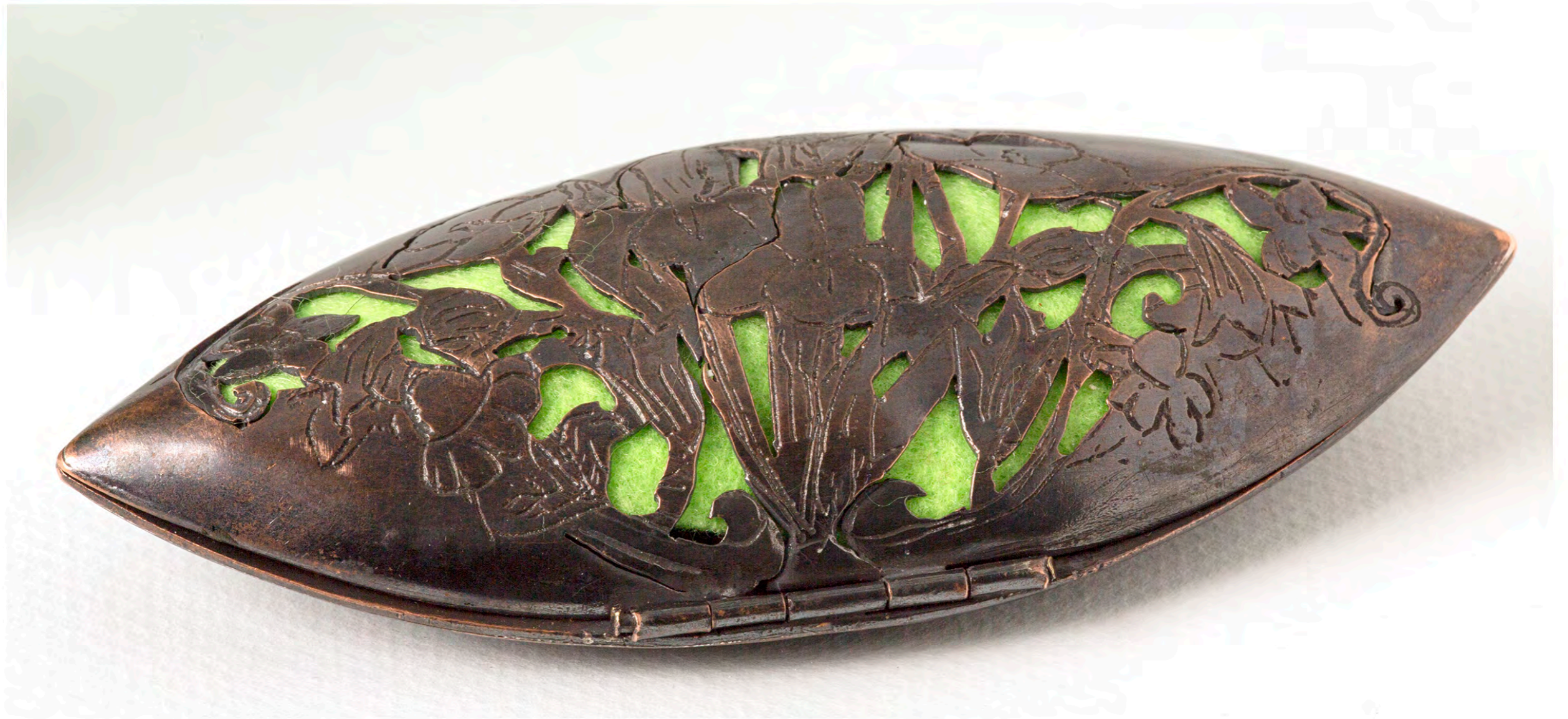
The Locket Resilience, 2017. Photography