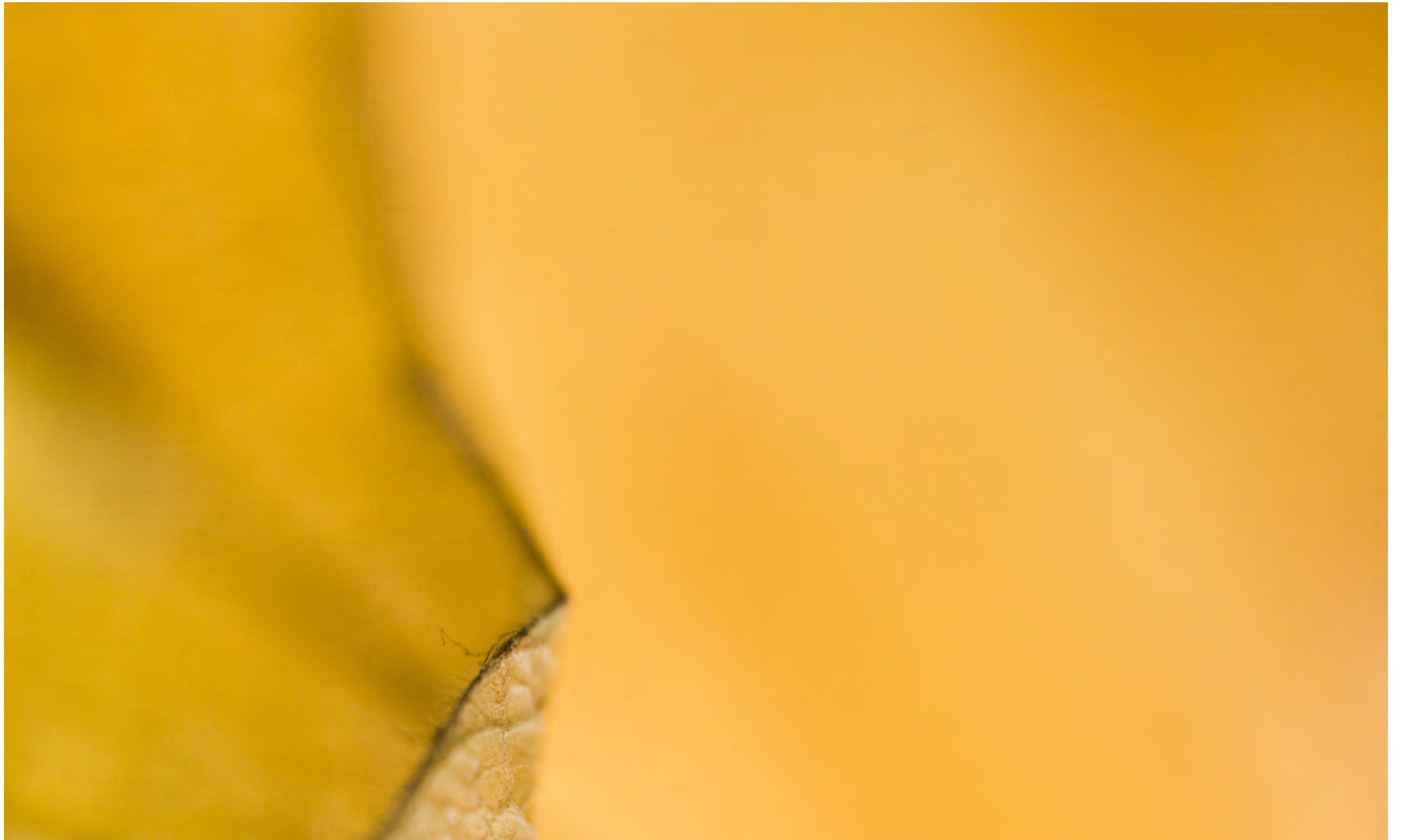
Hitting a Corner. L'uscita, 2019. Photography Variable Sizes