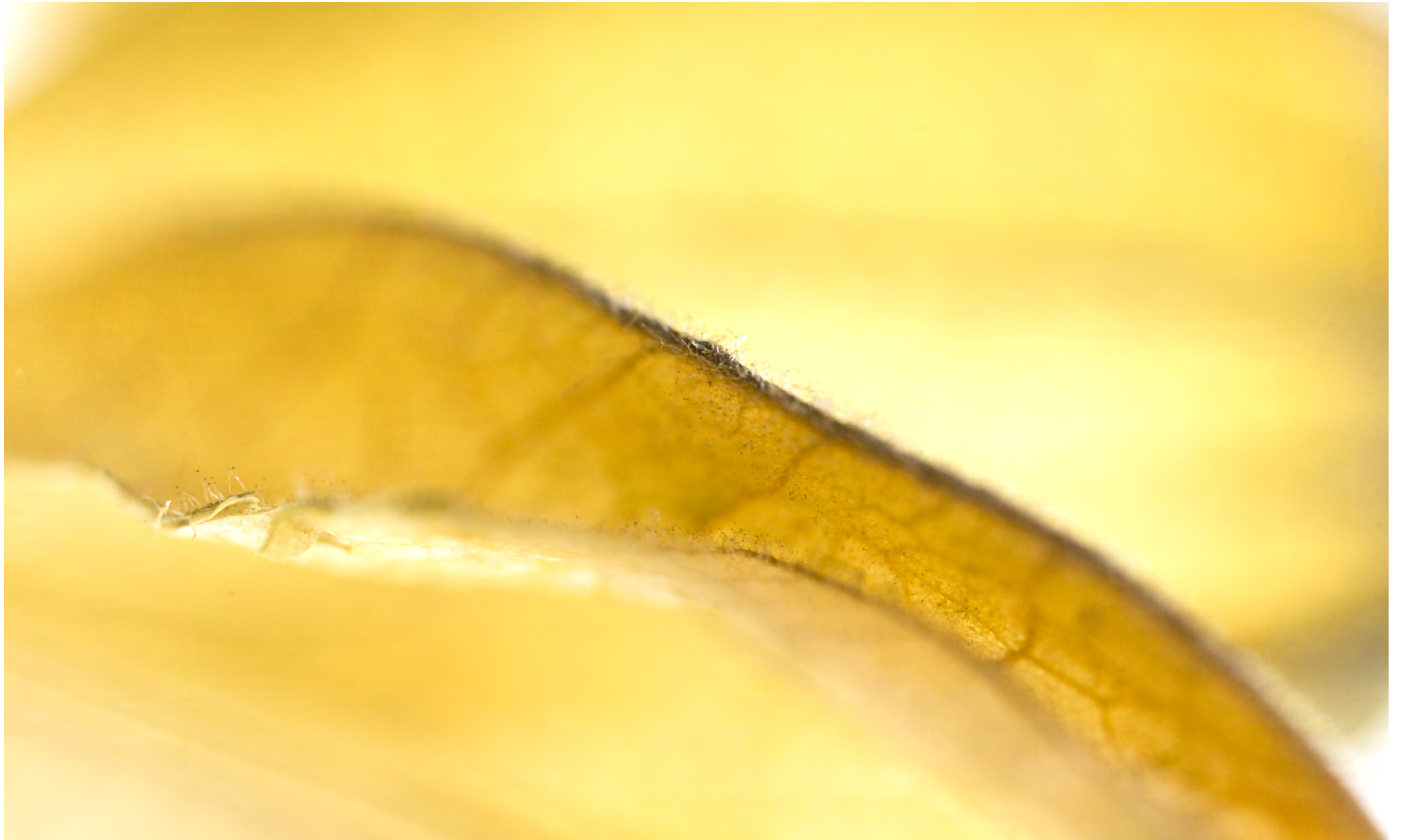
On The Edge L'uscita, 2019 Photography Variable Sizes