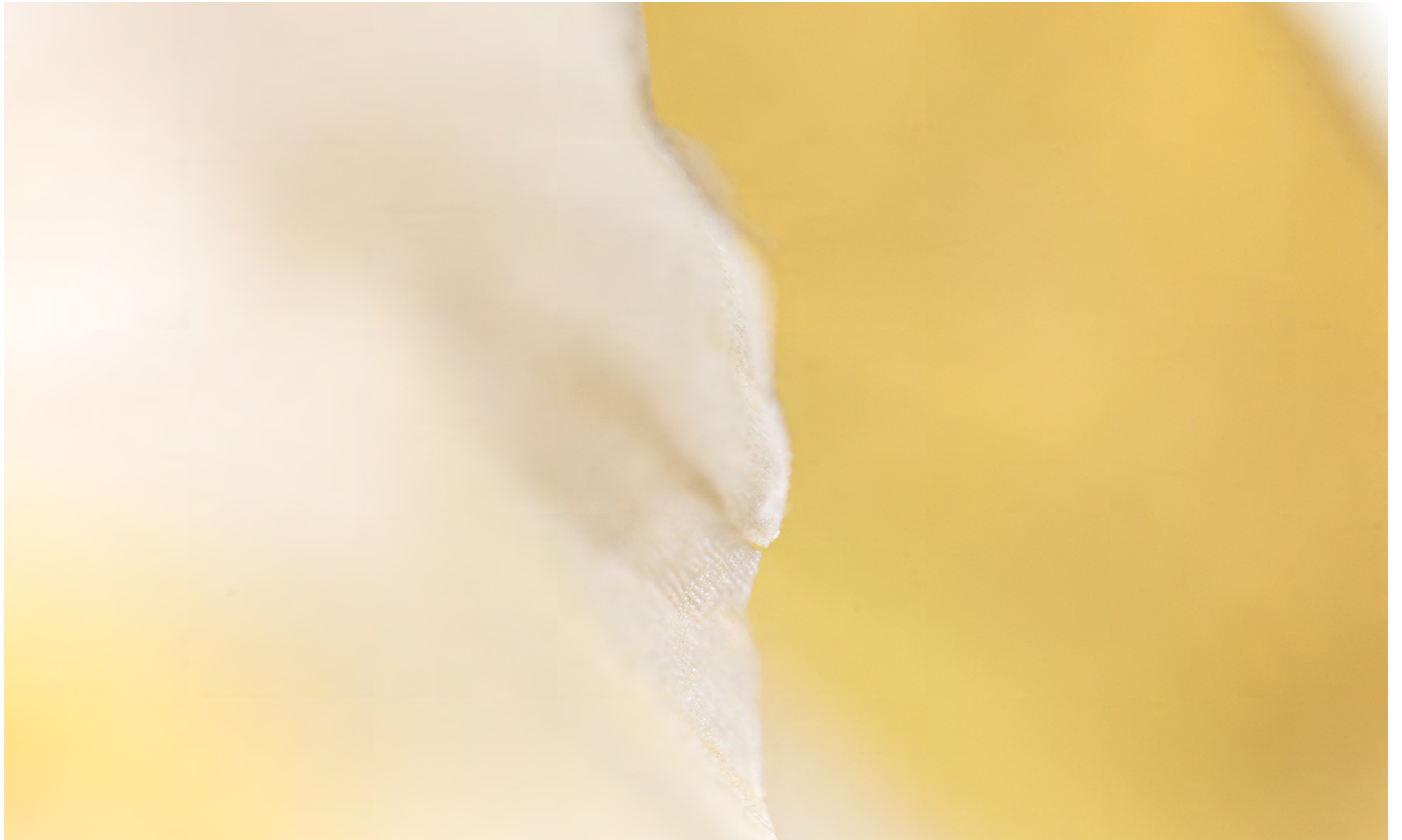
Hot n Cold L'uscita , 2019 Photography Variable Sizes