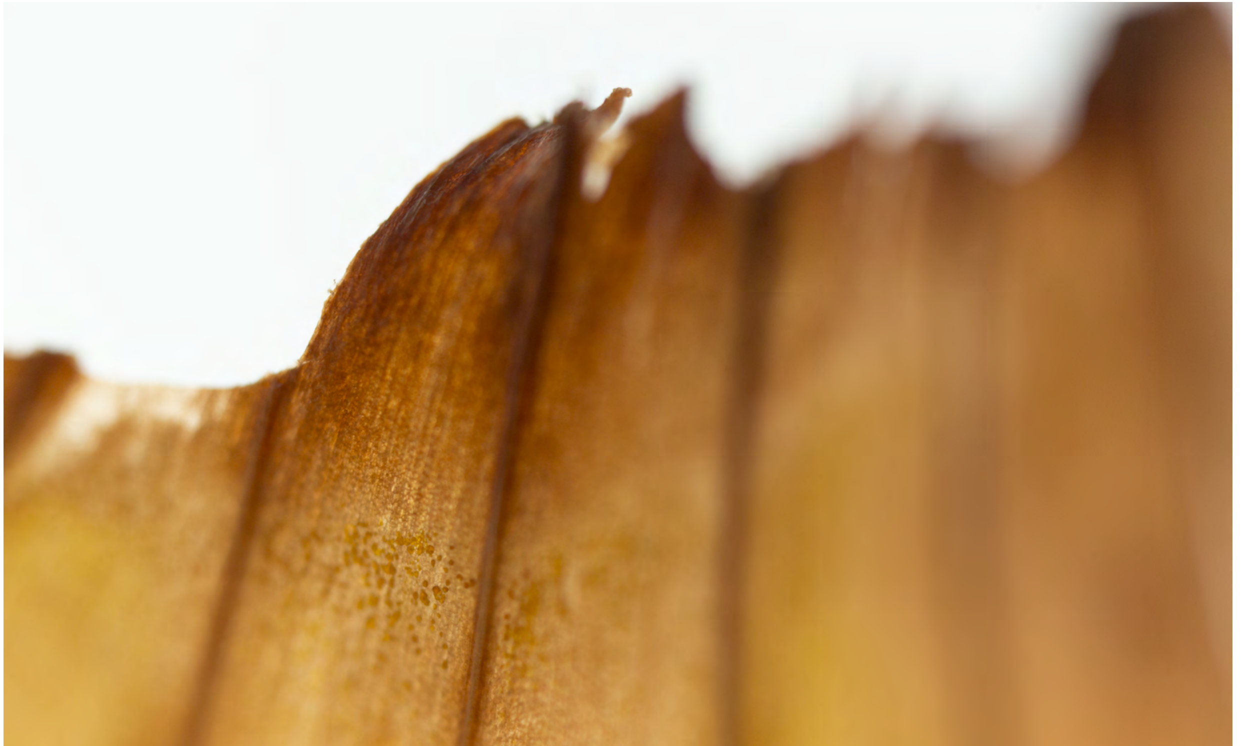
The Burn L'uscita , 2019 Photography Variable Sizes