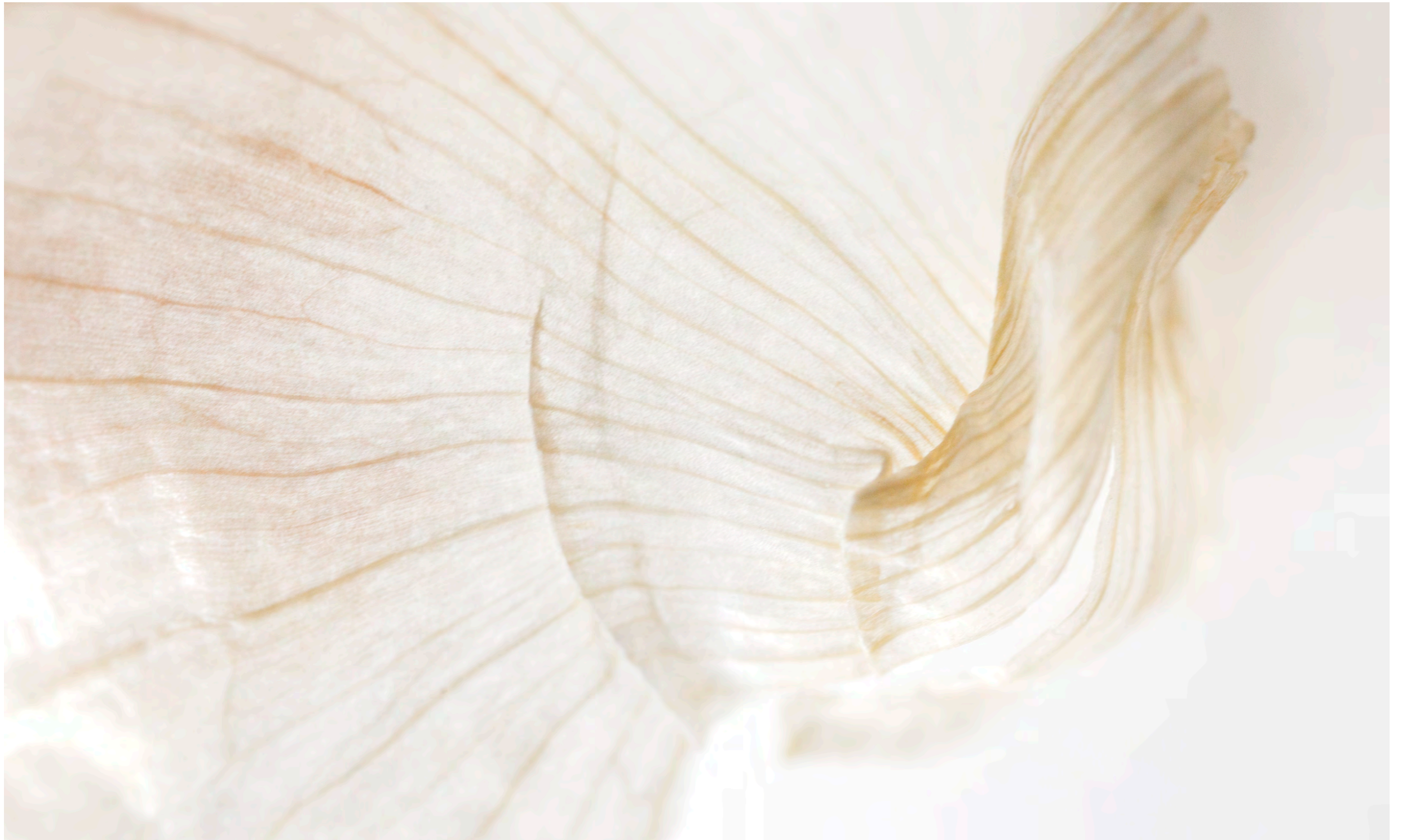
Translucent Garlic Skin Skin, 2019 Photography Variable Sizes

Delicate pink garlic skin lit from above and below to illustrate the delicate nature of the outer layer of the garlic skin