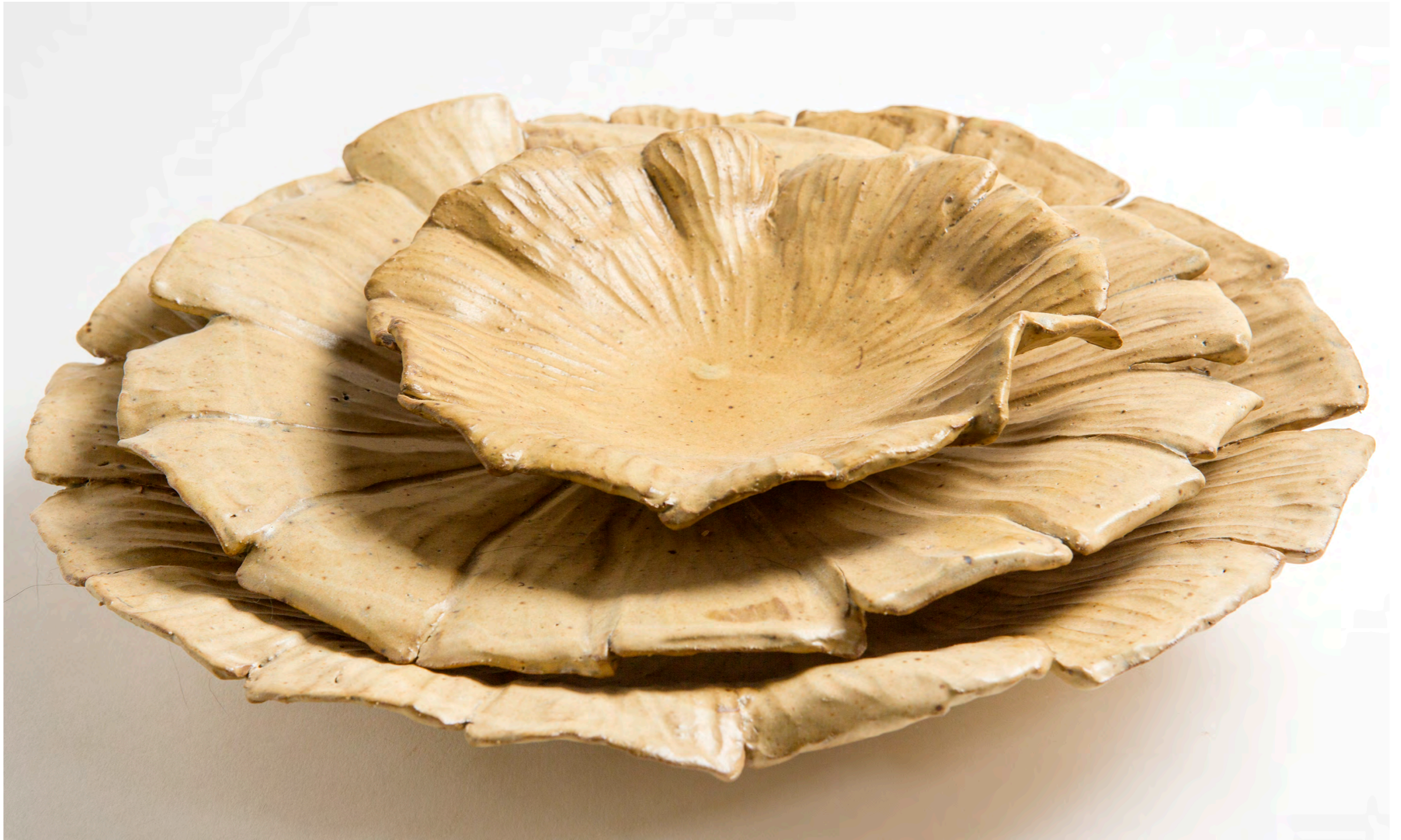
Nesting Resilience, 2017 Ceramics Various sizes