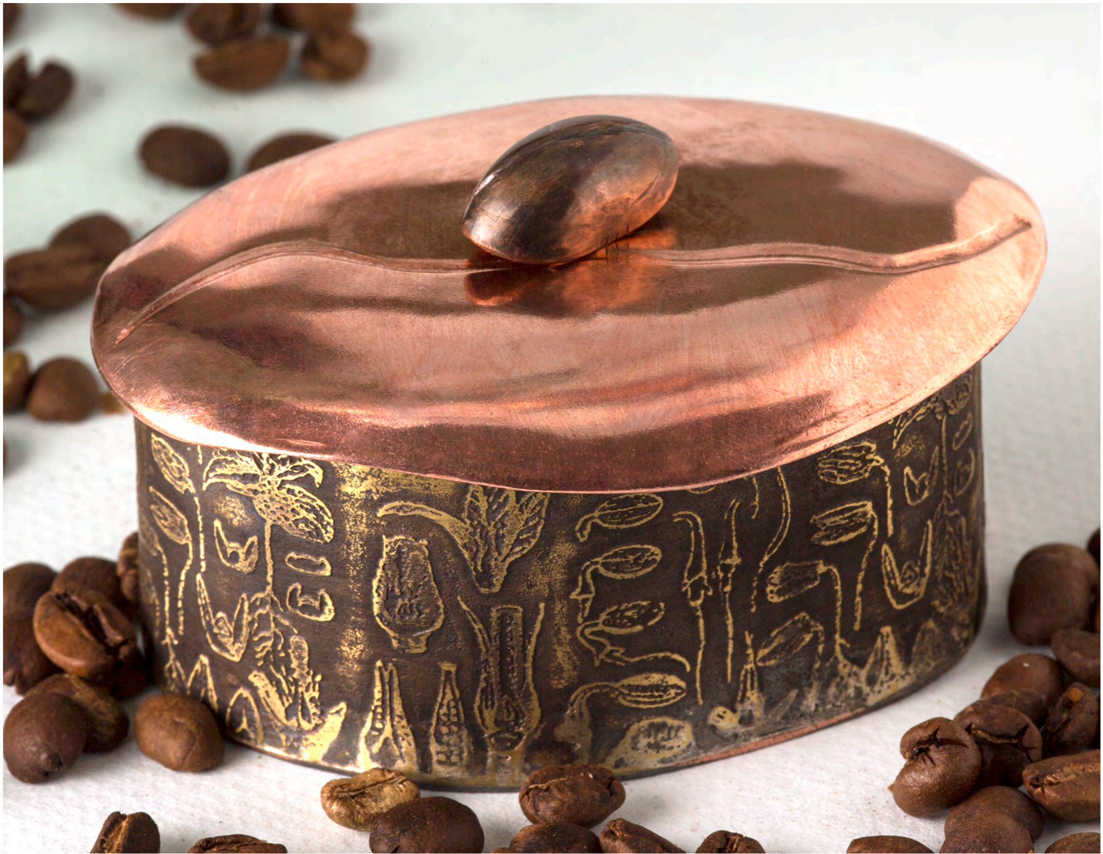
Relic Box Resilience, 2017 Copper and Brass