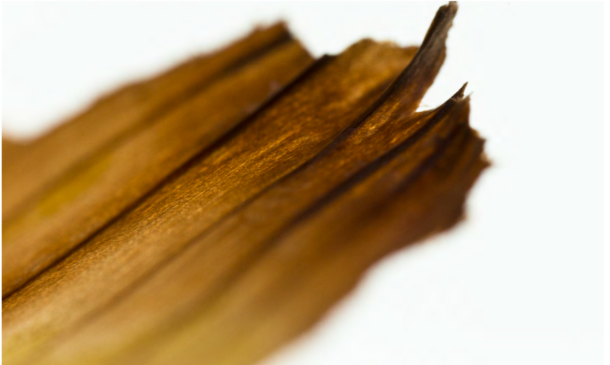
The Burn II L'uscita , 2019 Photography Variable Sizes