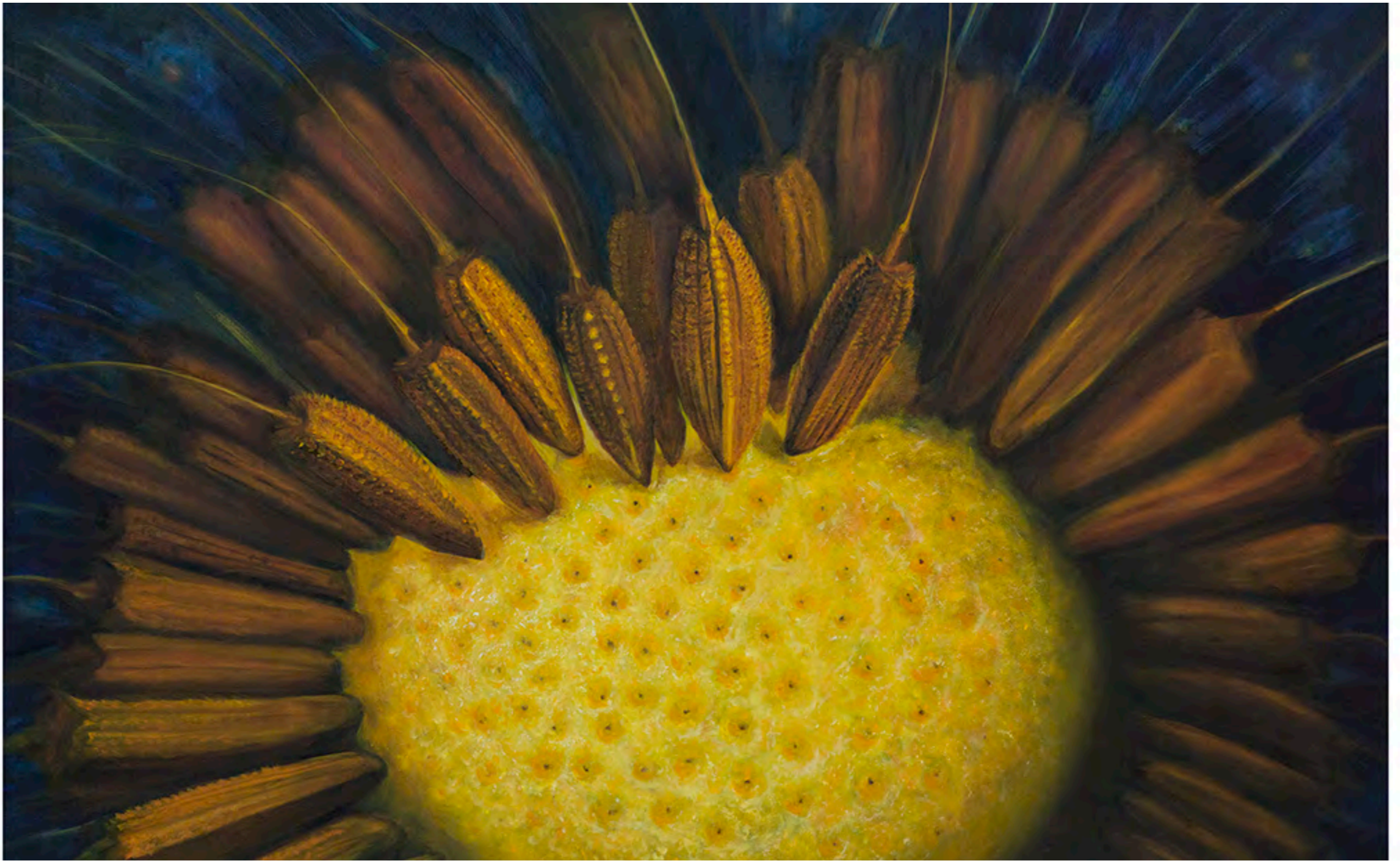
Seeds, 2017 Painting in oil 81X112 cm

Dandelion seeds ready to detach themselves from its receptacles