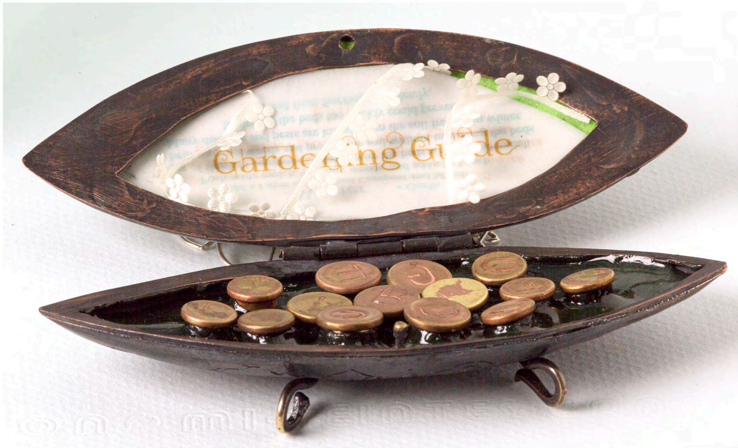
Open Locket Resilience, 2017 Copper and Brass 7-14 cm