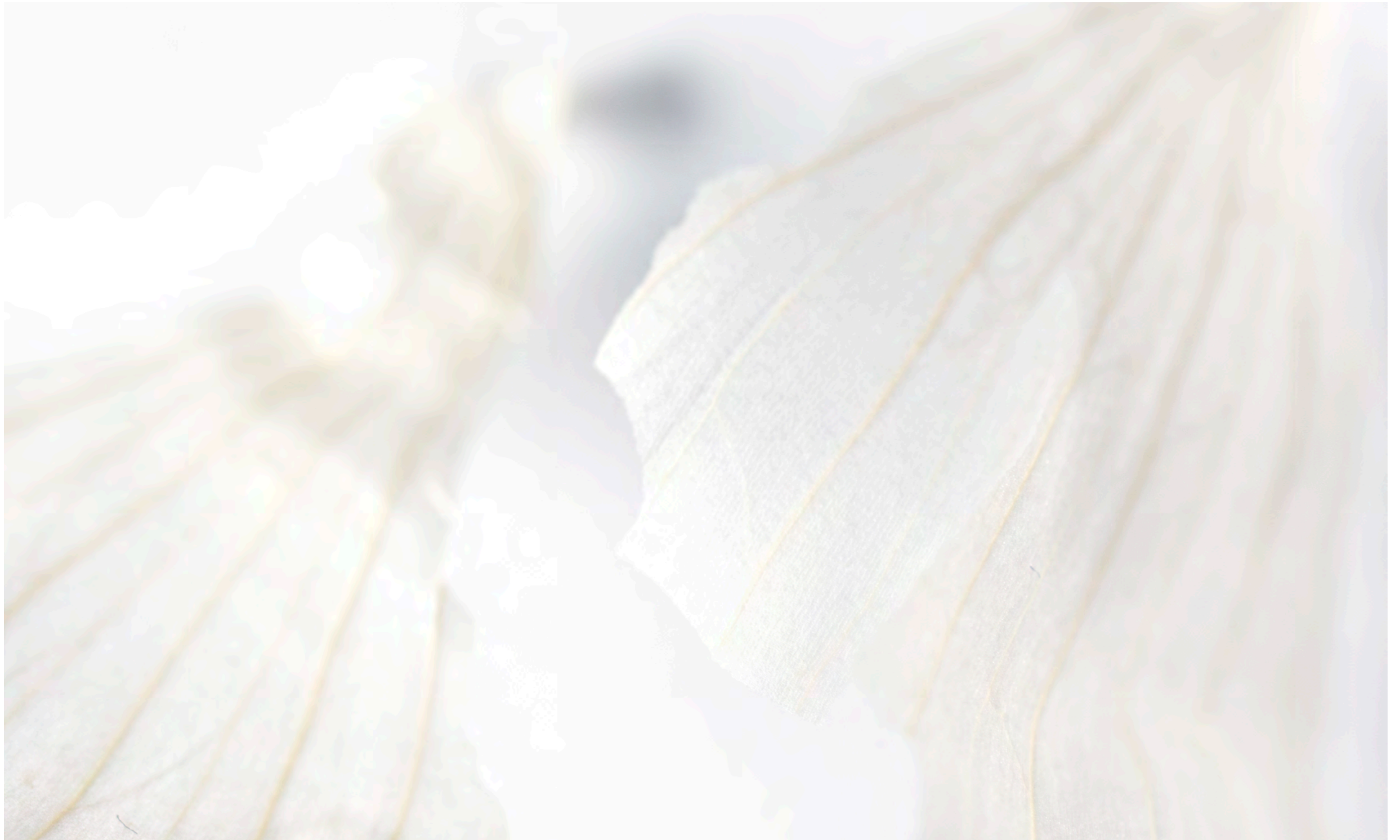
Translucent Garlic Skin Skin, 2019 Photography Variable Sizes

Delicate pink garlic skin lit from above and below to illustrate the delicate nature of the outer layer of the garlic skin